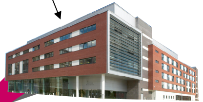
Conference Aston Conference Centre and Hotel